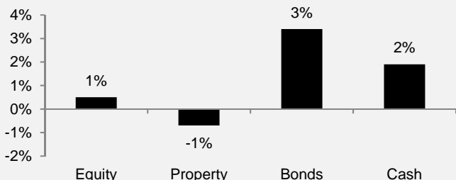
Domestic Asset Class Returns (12 Months)

The Fund's lower short term returns, relative to previous years, is consistent with the lower returns generated by the underlying asset classes, domestically (i.e. typically comprising 75% of Fund assets), illustrated below :